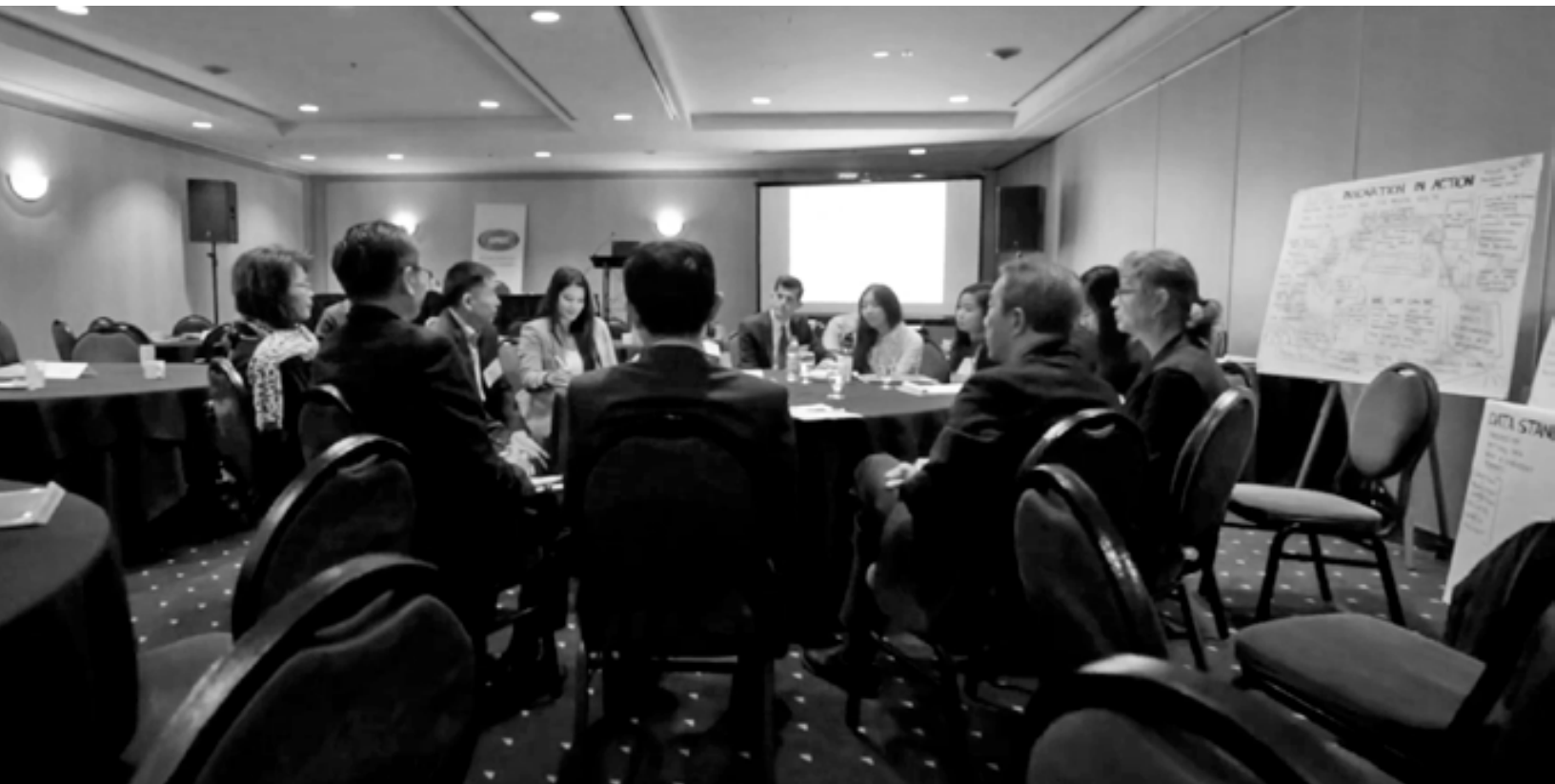
'APEC Innovation in Action: Building the Digital Hub for Mental Health' Conference (Vancouver, June 2017)

University of British Columbia (UBC) campus in Vancouver